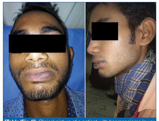
[Table/Fig-8]: Clinical picture of a patient with haemangioma lower lip. [Table/Fig-9]: Clinical picture of a same patient after two sittings of sclerotherapy.

The findings of the present study thus indicated that STDS sclerotherapy is a useful, convenient, cheap, safe,